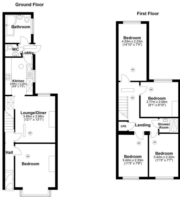
6 Umberslade Rd, Selly Oak, Birmingham